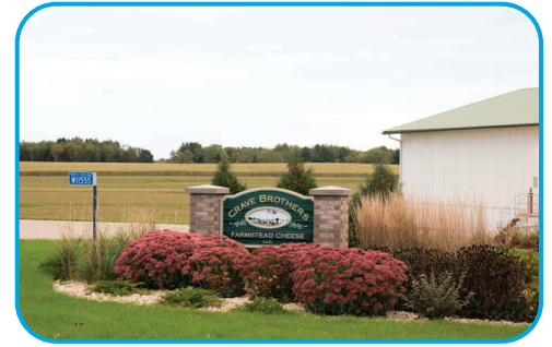
Crave Brothers run a net zero farm in Wisconsin.

Now take a look at the nutritional profile of milk on the wall poster. Reflect on this information and your research findings to write a short position paper describing the role dairy could play in sustainable diets on a global scale. Think about the amount of food, and the different types of food, that would be required to replicate the nutrients found in milk. How would the environmental footprint and cost of all those varied resources compare to the cost and footprint of providing three servings of dairy, considering that a cow can produce up to eight gallons of milk per day?