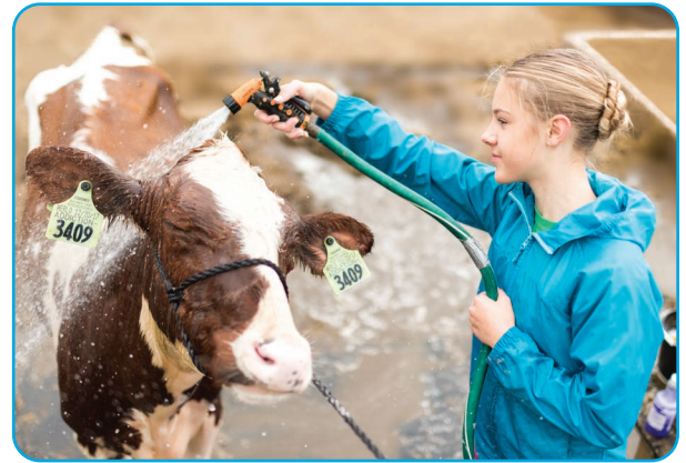
Young farmers balance attending classes at school and working on their family dairy farms.