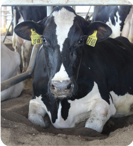
Dairy cows on recycled bedding.