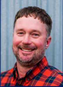
Chad Sime Residence: Crawford