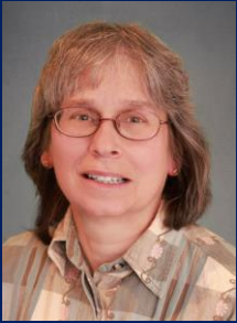
Peggy Pankratz Residence: Wood